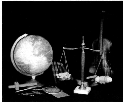
Liss Platt, from "17th Century Series", 1992 below: Product Photo , 1992