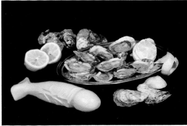
Liss Platt, from "17th Century Series", 1992