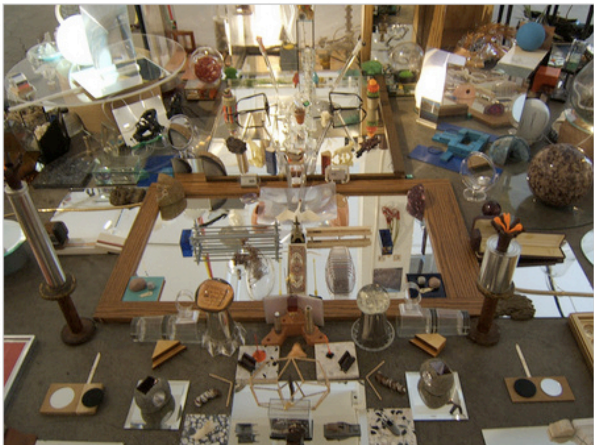
Toronto Terrarea Club Installation for Foreign Legionnaires 2009 Detail

EDWARD DAY GALLERY, TORONTO AUG 6 TO SEP 6 2009