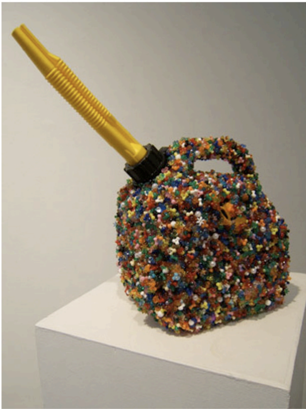
Shake-n-Make Relic 2009

Subscribe to Canadian Art today and save 30% off the newstand price.