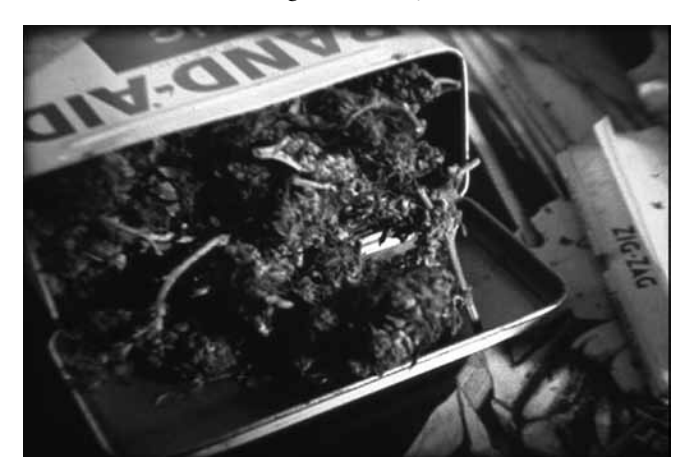
Film still from You Can't Get There From Here.