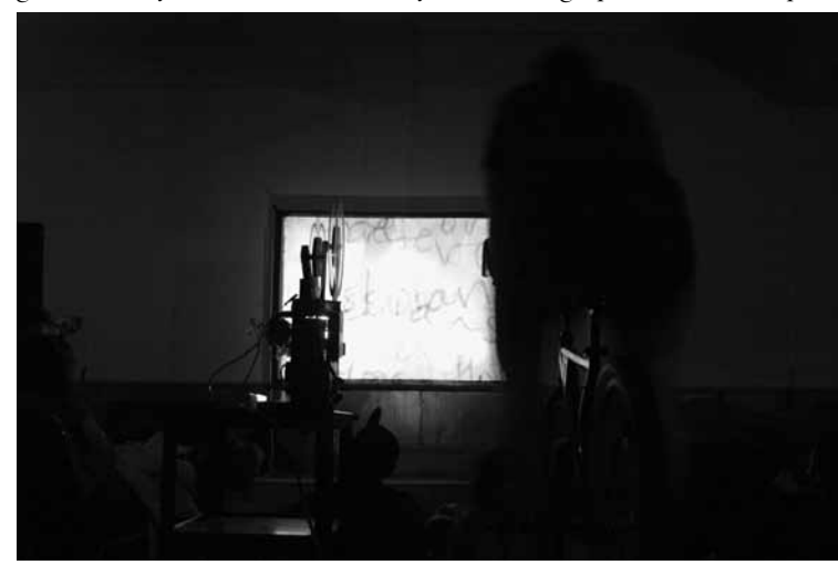
Platt pedals to keep the film rolling in You Can't Get There From Here (Redux).

These enmeshed bodies provide a backdrop for You Can't Get There From Here (Redux) , a performance wherein I pedal a bicycle to power the projection of a short experimental film. It is both a story on celluloid and an active body struggling to get that story told. While ostensibly an autobiographical work